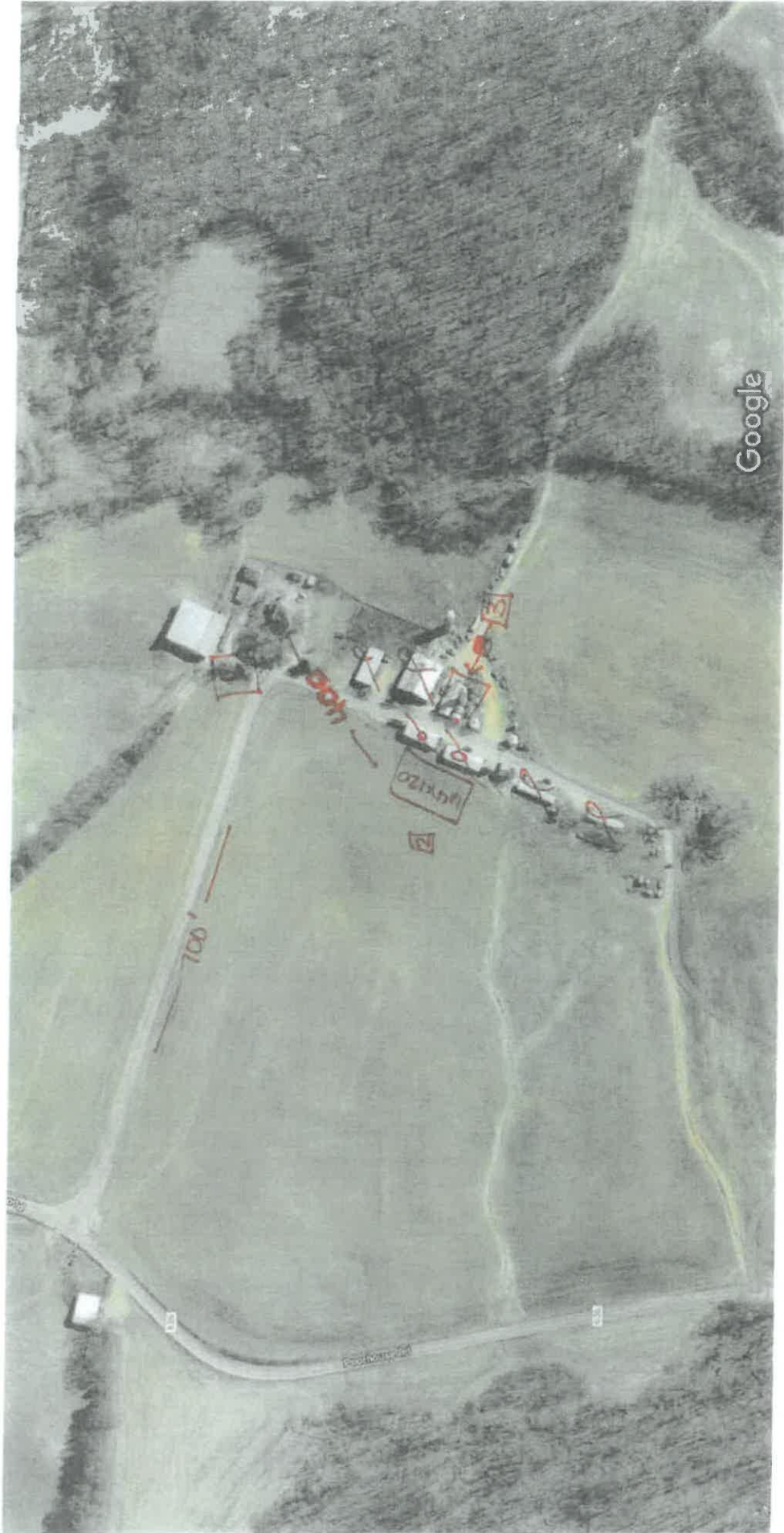
100 ft